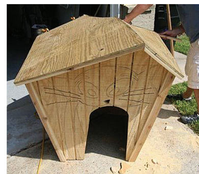
ROVER RESIDENCE (photo shows in progress)