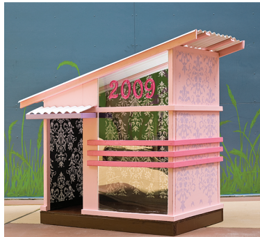
2009 BISCUIT LANE