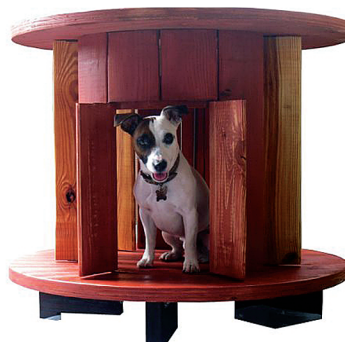
LINDSAY'S PORK CHOP

My dog kids are LuLu (a French Bulldog) and Ponce, my swag Labradoodle, and I, like most parents, give them all that I can. In return, I get wet kisses, snuggles when I am sick and always, unconditional love!